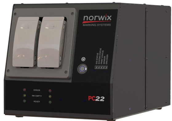
Dual 775ml bulk Ink Supply

Small footprint (15" x 10" x 9.5") industrial housing with dual bulk docking stations, power and monitoring LEDs